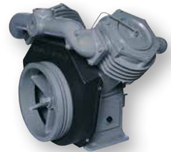
APLGAA-CH, APLGBA-CH, APLHAA-CH, APLHBA-CH Single-Stage Compressor