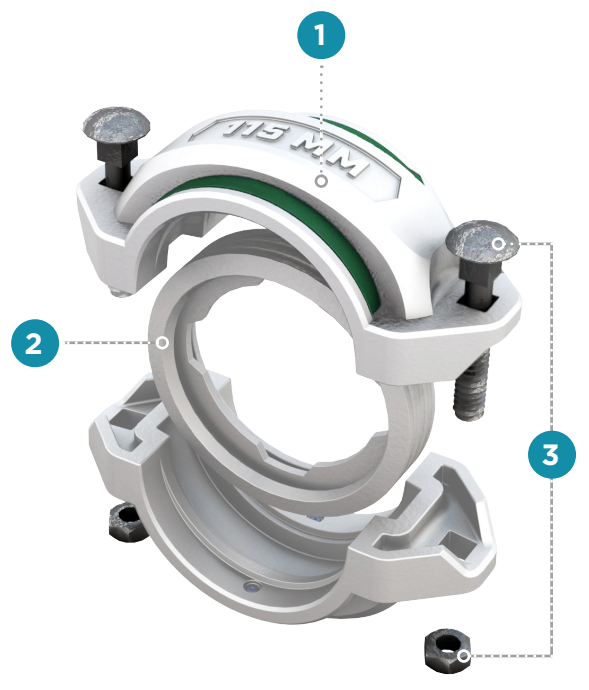
Push to Connect Marine Grade Aluminum